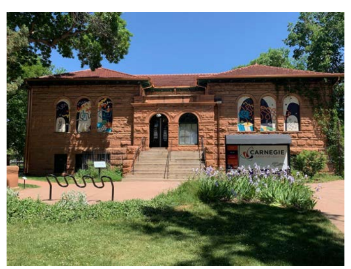
The Carnegie Center for Creativity is undergoing a huge historic restoration to allow for more accessibility, creating a State of the Art multi arts facility - a $2.4 million project!